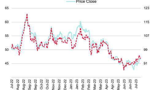
Thai Oil (TOP TB)